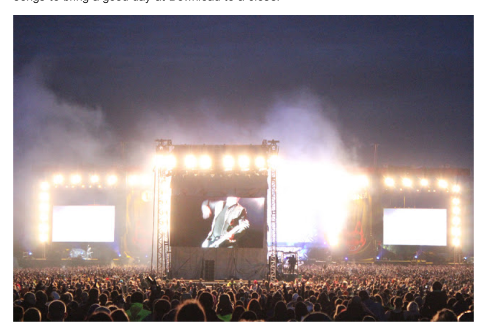
Our coverage of Download day by day