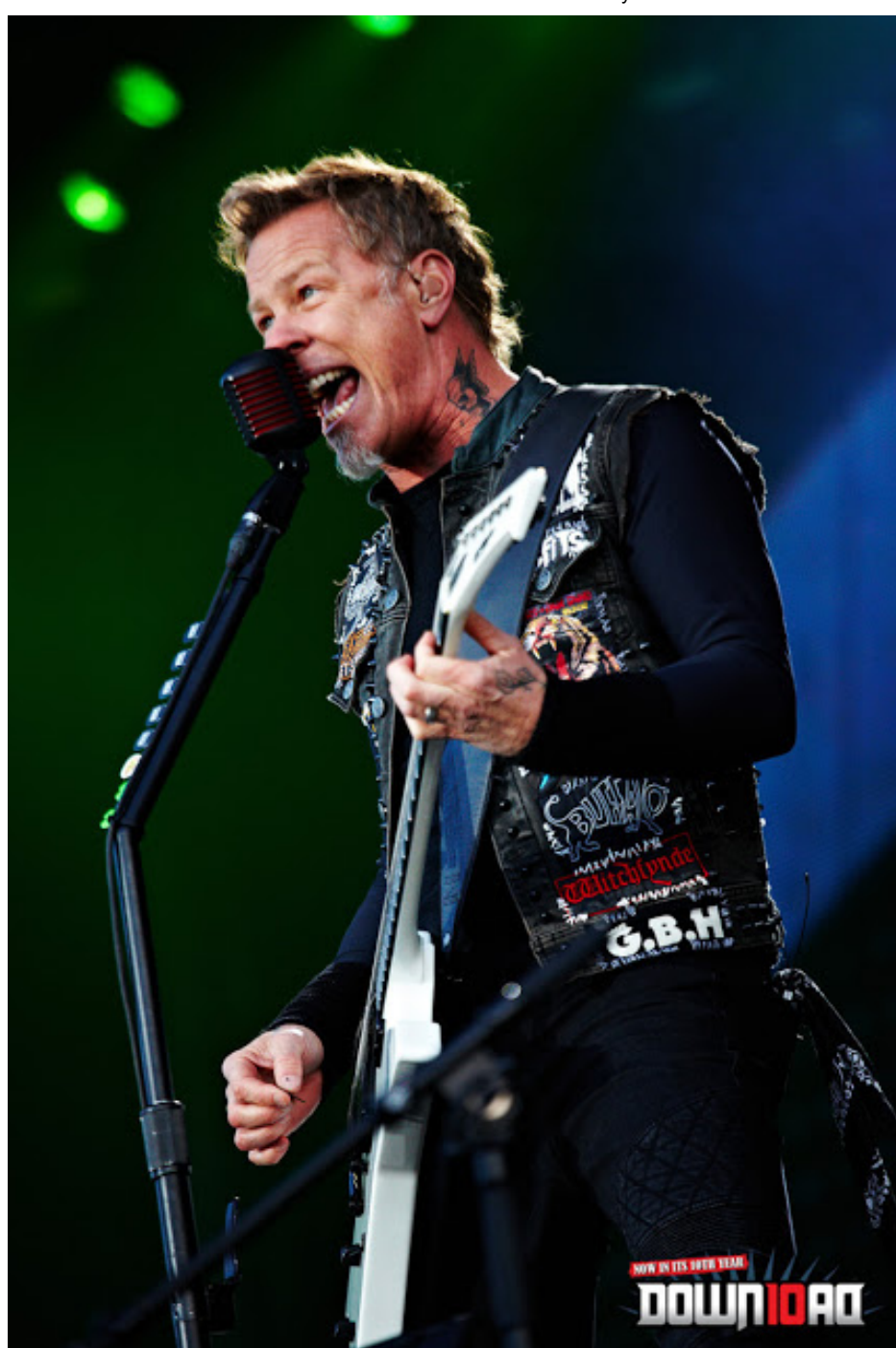
Metallica

Therefore when the big number came, my word they were good! The huge Holier Than Thou , The Unforgiven , Wherever I may Roam and of course Nothing Else Matters were flawless and the powerful Sad But True , got every single person in the enormous crowd pumping their fists and straining their vocal chords.