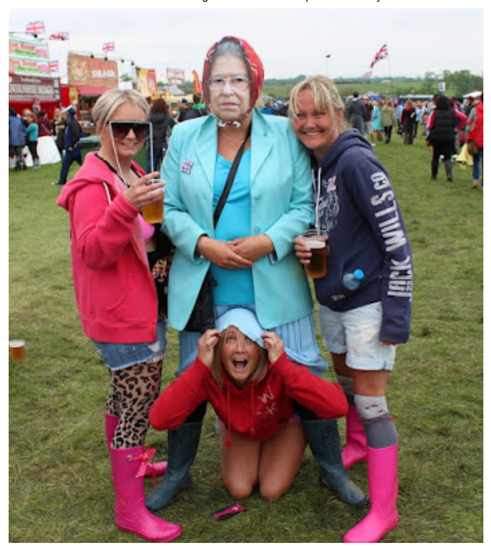
Even she could not miss Skam