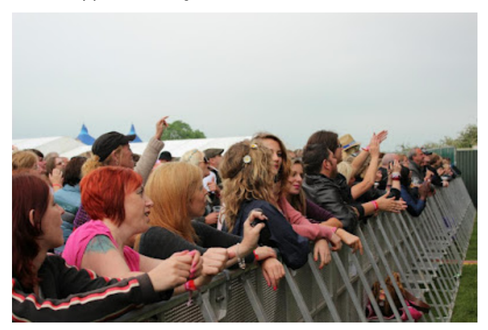
Even though the sky was overcast, at least it was not raining for the start of the festival.