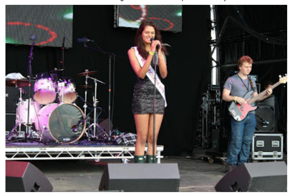
The crowd enjoyed the main stage.