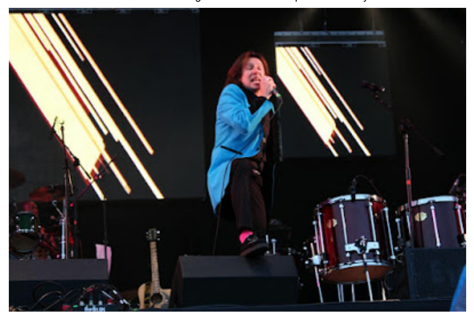
One of Leicester's famous bands from the 70s, Showaddywaddy were a big pleaser for the main stage crowd.