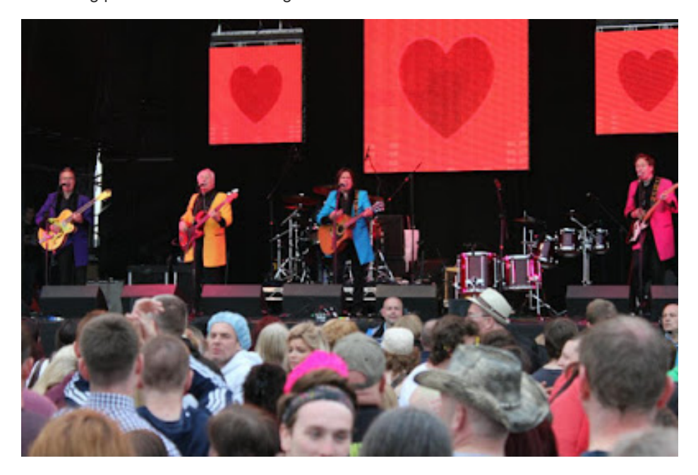
Performing all their well known classic songs they soon had people dancing and clapping along with them.