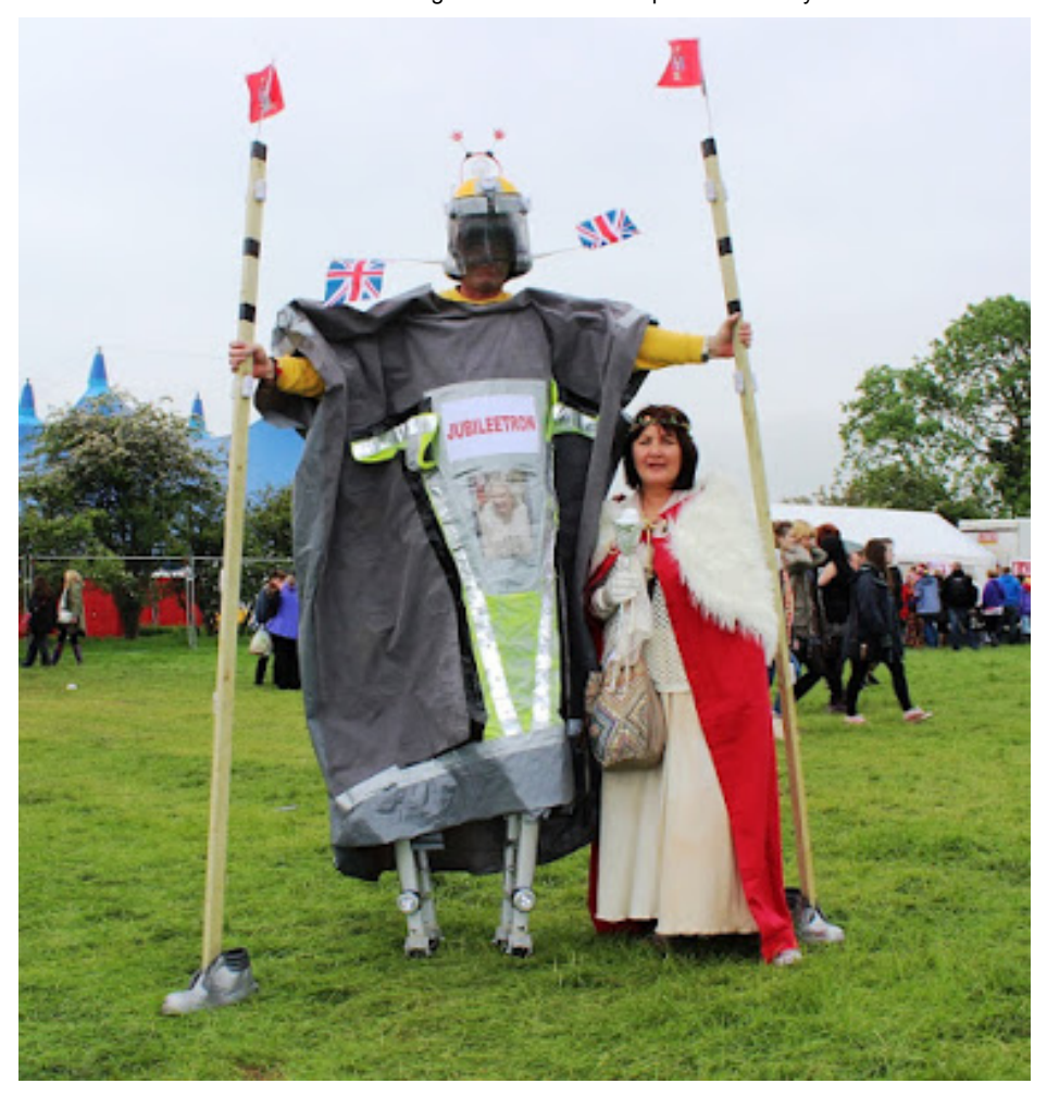
The 'Jubileetron' won the fancy dress competition.