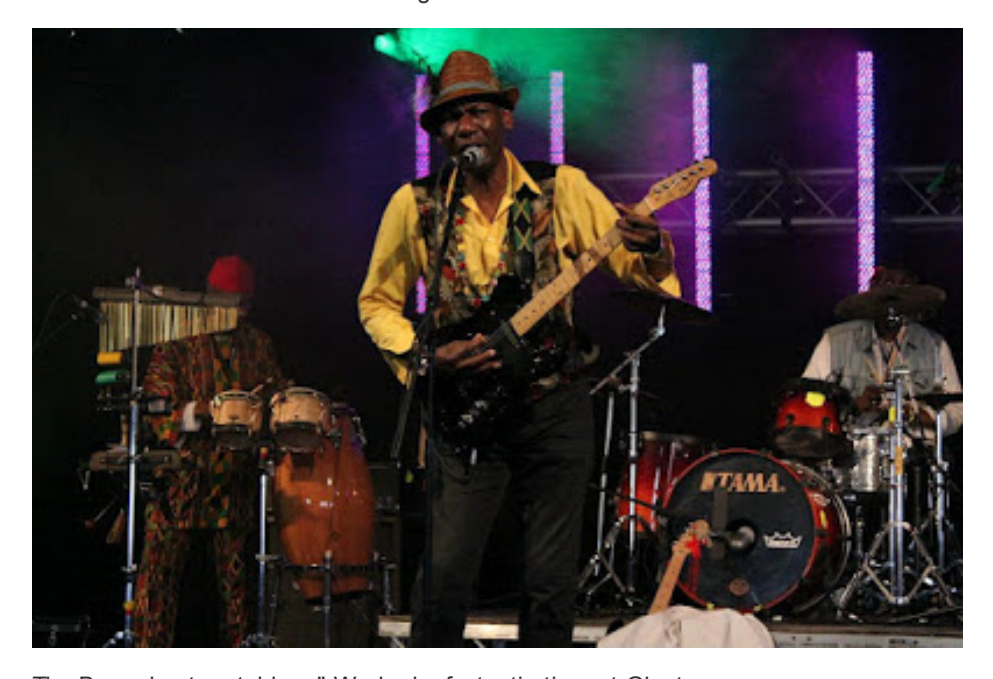
The Broombusters told us "We had a fantastic time at Glasto 2012, we could have been onstage all day! Thanks to the staff and crew for a brilliant festival and hopefully see you again next year!"