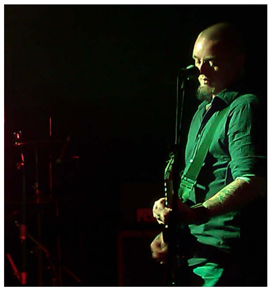
Resin on stage at The Soundhouse