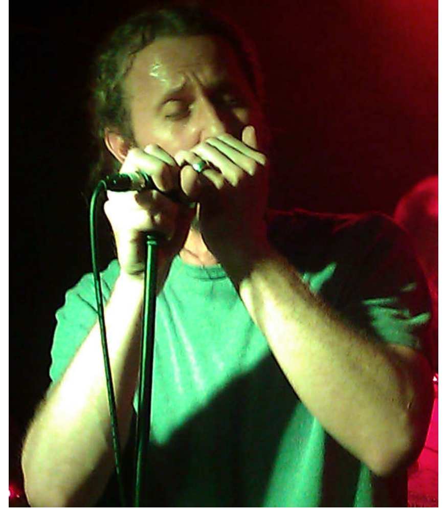
Resin on stage at The Soundhouse