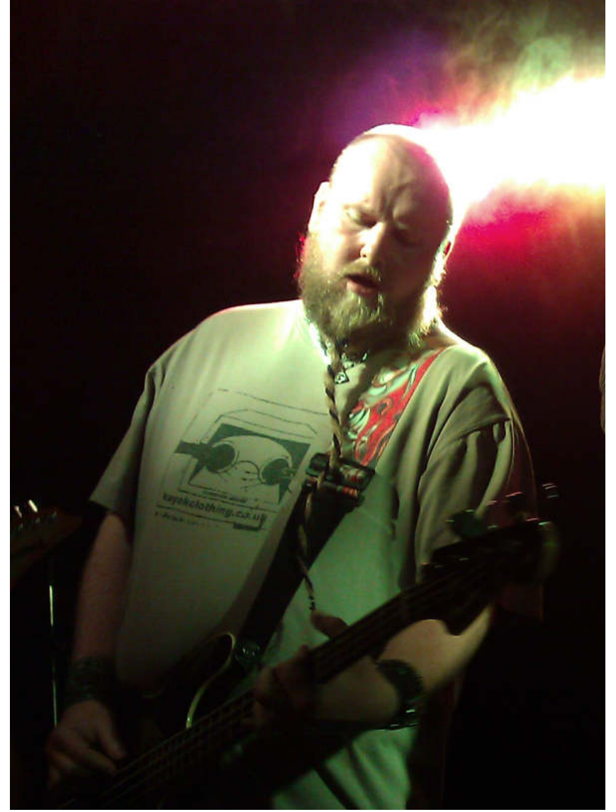
Resin on stage at The Soundhouse